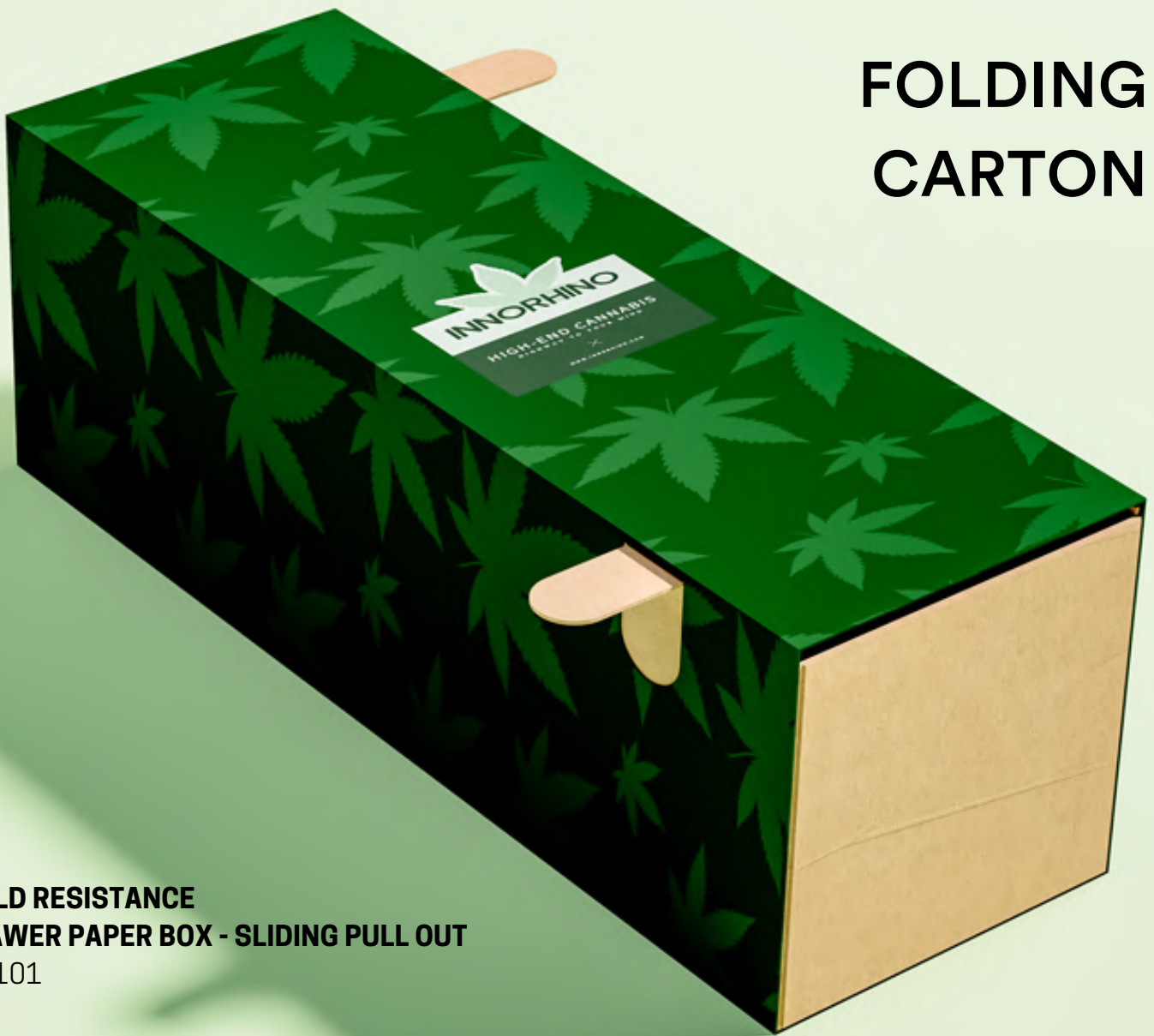
CHILD RESISTANCE DRAWER PAPER BOX - SLIDING PULL OUT A2-101