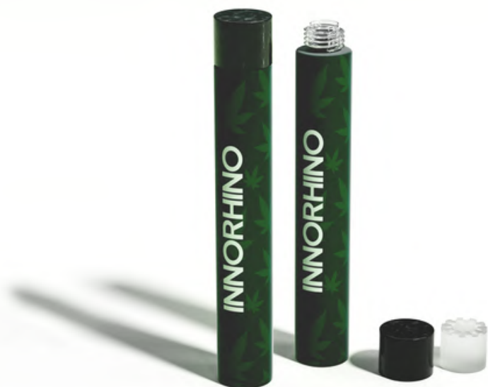
CHILD RESISTANCE GLASS JAR I1-115