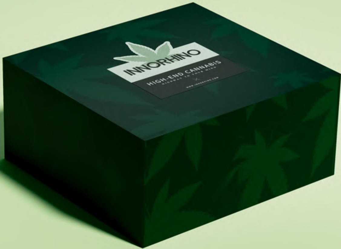
CUSTOM CORRUGATED ROLL END TUCK TOP BOX K1-104