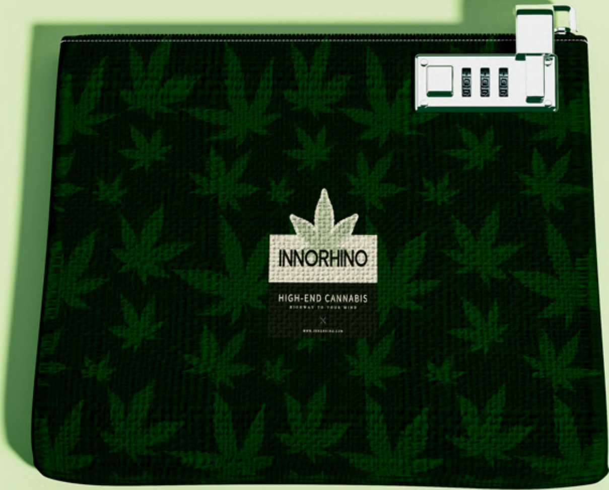
COMBINATION LOCK CLUTCH W4-101