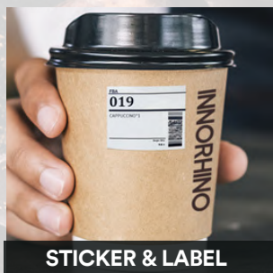
STICKER & LABEL