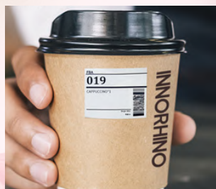
STICKER & LABEL